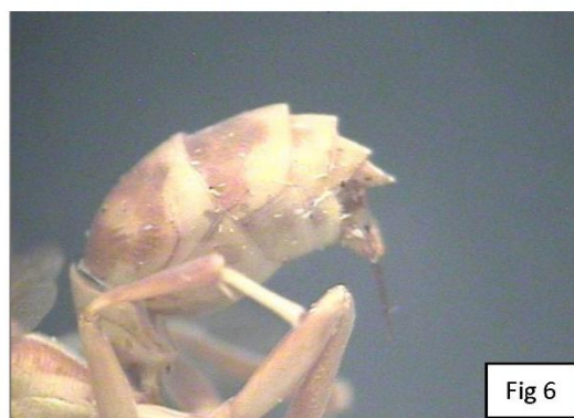
Figures 1-6: Polistes indicus , ♀. 1 Dorsal view complete. 2. Head, frontal view. 3. 1 st gastral sternite (with basal margin). 4. Mesosoma, lateral view. 5. Habitus. 6. Metasoma, lateral view.