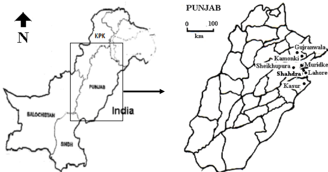
Fig 1: Map showing snails collection areas.